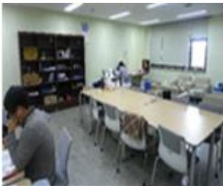
HGD&E Seminar Room (Newton Hall 411)

Various seminars related to EE & ICT Convergence Startup are held in the seminar room and this is where students of HGD&E study.