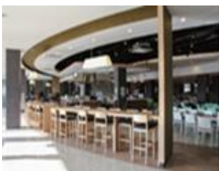
Shinsegae Food, the Student Cafeteria