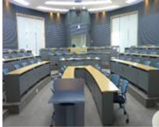
KOICA Lecture Room 1 (All Nations Hall 414)

Most of the KOICA Course lectures are held in the ANH 414.