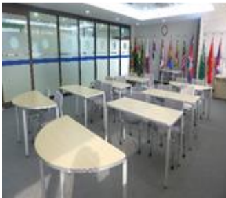
KOICA Lecture Room 2 (All Nations Hall 401)

Most of the KOICA Course lectures are held in the ANH 414.