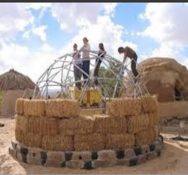
Creative Ecology at Kibbutz Lotan

Candidates are expected to have academic training or equivalent professional qualifications in relevant subjects, with at least 5 years of practical experience. They should be presently engaged in promoting sustainable living in their communities.